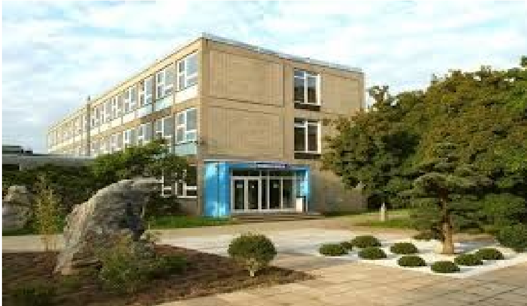
Outside of the Faculty Engineering