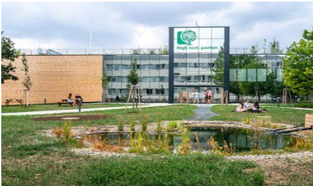
Outside of the faculty Forestry and Wood Sciences