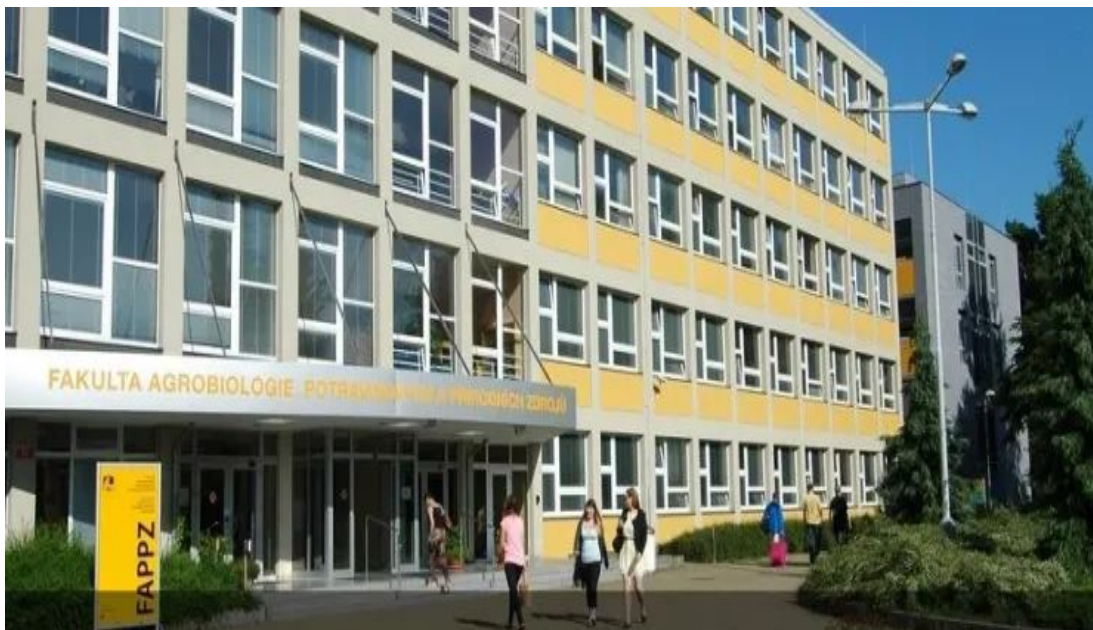
Outside of FAPPZ faculty