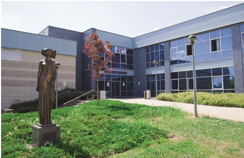
Library at CZU

In CZU library everyone will find a place fitting their needs. Whether it is a space to study, relax and have fun or even simply rest.