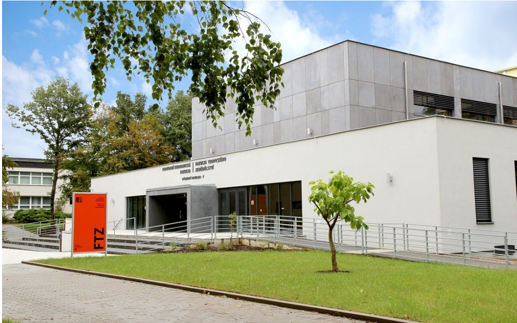
Outside of Faculty of Tropical AgriSciences