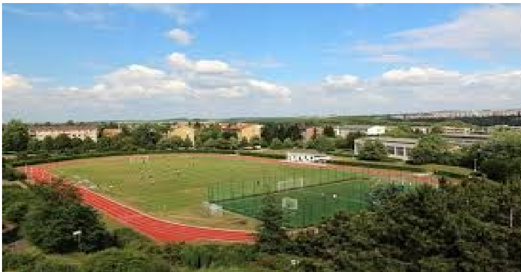
Football field at CZU

Sports center is an organization that provides a comprehensive program of physical education and sports activities for students, employees