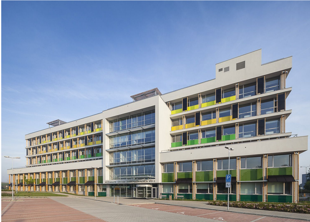
Outside of the faculty Environmental Sciences