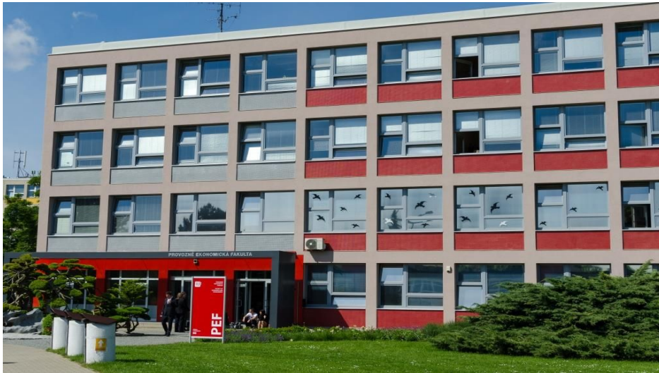
Outside PEF faculty