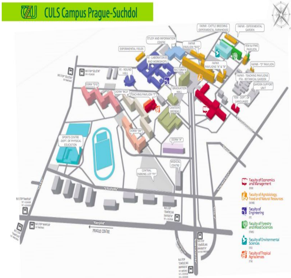
Map of Czech University of Life Sciences campus